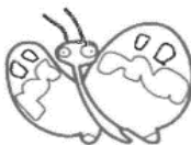
Red Admiral Butterfly