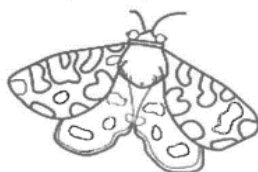
Garden Tiger Moth