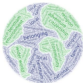
Our place in our world