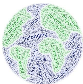
Our place in our world